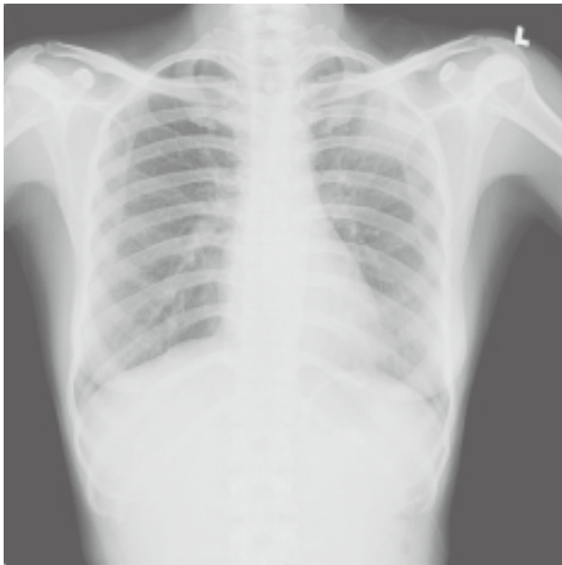
Figure 1. Chest X-ray.

X-ray showed homogenous peripherally based opacity seen in the left upper zone with no evidence of adjacent rib destruction or calcification (Figure 1). Mantoux test, sputum for acid fast bacilli, and Elisa test for HIV were also found to be negative. Sputum culture was sterile.