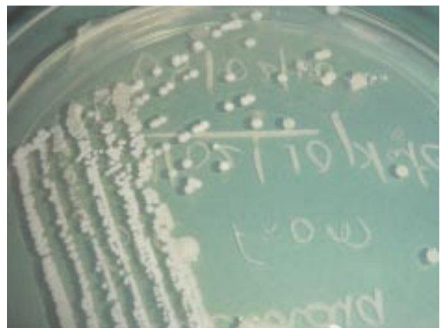
Figure 4. Culture of bronchial brushings.