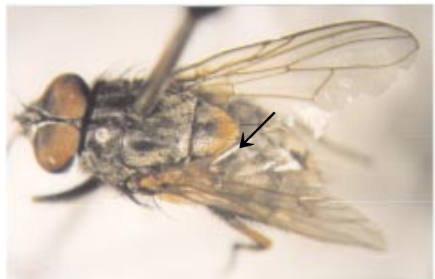
Figure 1. M. stabulans (Apex is yellow).

Muscina Stabulans (Fallen, 1817): During this study, 143 cases (58 female and 85 male) of this species were captured from central regions of Tehran. Tibia and the end of femur are yellow and 4th vein curved in this species. Scutellum in apex is yellow or light brown. The eyes have no hair. Length of the body is 8–9 mm and little bigger than house flies (Figure 1).