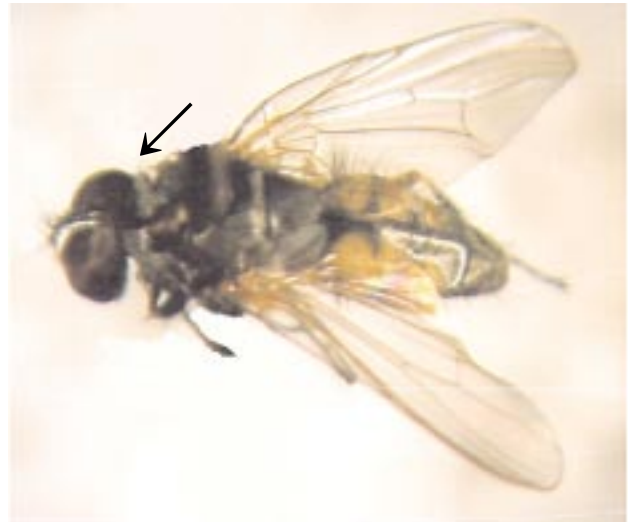
Figure 4. F. canicularis (1–3rd segments of abdomen is yellow).

behaviors and abdomen color especially on backside which is completely black in F. scalaris . It is yellow in F. canicularis (Figure 4).