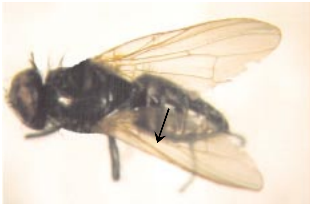
Figure 2. F. scalaris (Segment of abdomen is dark).

the inferior of tibia of mid leg, there is a bump with small teeth and in females parafacial has no hair. Length of body is 6–7 mm (Figure 2, 3).