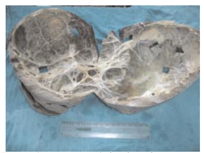
Figure 1. Cut open specimen of spleen showing large cystic space with septae inside.