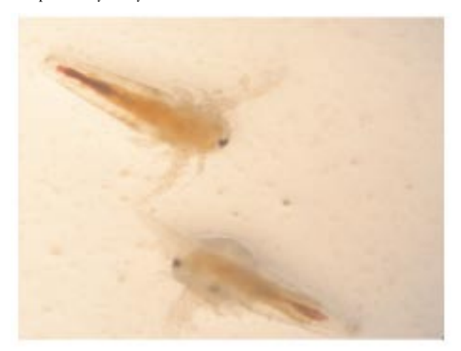
Figure 3. Light microscope micrograph of the E. elatior flower extract treated A. salina .