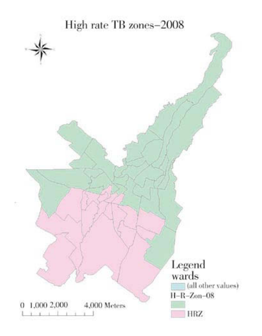
Figure 2. High rate TB zones in 2008.

Figure 1. High rate TB clusters in 2007.