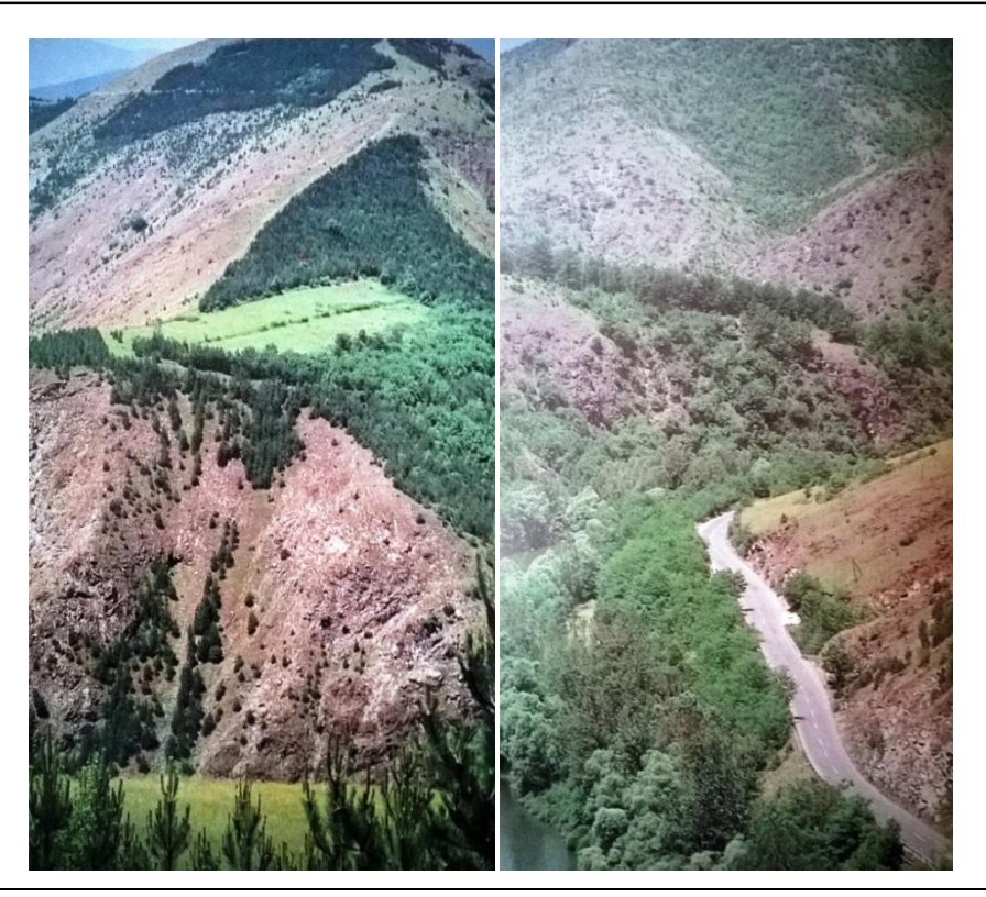
Figure 4. Panoramic photography of planted forests in the valley of the Ibar River (Photo by Šmit et al. 1997).

In early 1973, the Institute of Forestry in Belgrade had mastered the technique of production of plant material with protected root systems and, among the first in this part of Europe, begun afforestation during the vegetation period (June-September). These activities led to the afforestation of large areas of the most unfavorable eroded bare lands through mass actions. Approximately 20,000 hectares of bare lands were afforested annually (Ratknić et al. 2007).