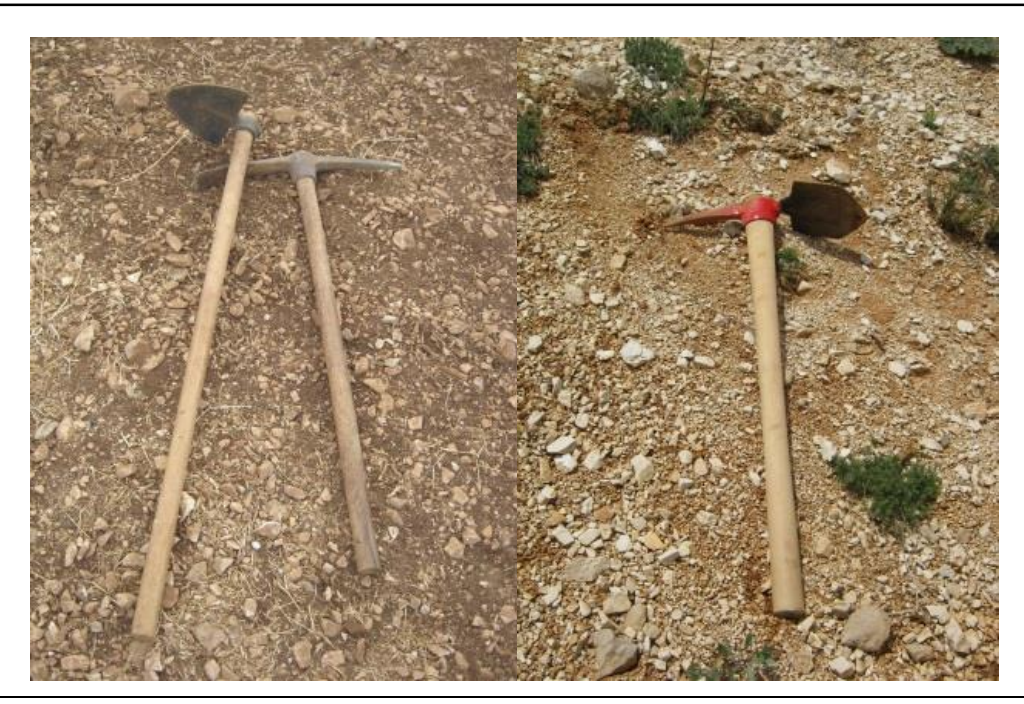
Figure 7. Left: Two tools, a hoe and a pick, were traditionally used to plant seedlings in Lebanon's rocky soils. Right: Combining them into a new tool hasimproved outplanting efficiency with reduced labor, and along with target plants, is increasing seedling survival and growth.