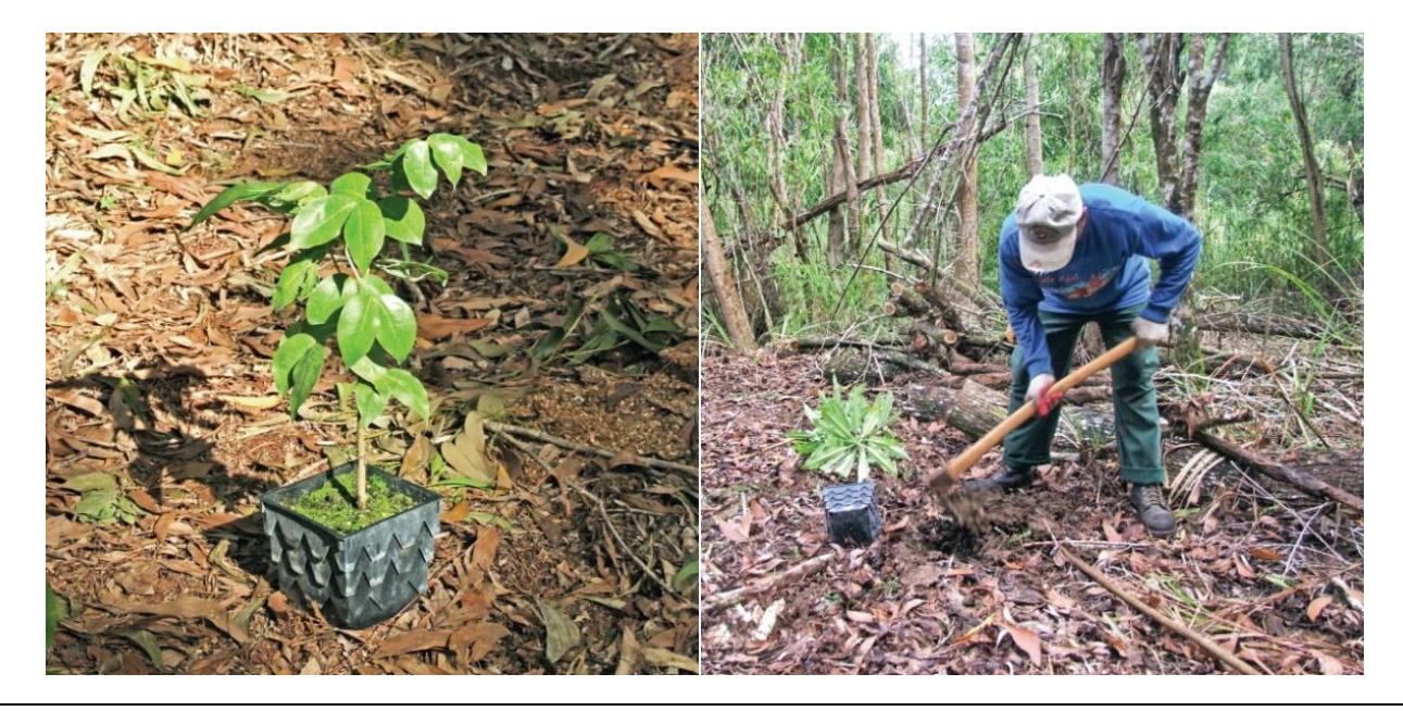
Figure 2. Using the Target Plant Concept, nursery and land managers work together to specify what type of plant material would be best suited for the project. Left: Shown is a native reforestation project in Guam, where target plants included native trees such as Intisa bijuga (Colebr.) Kuntze grown in large, 4-liter root-training square containers. Right: The native seedlings were planted using a mattock in soft clay soil.

Short, non-rooted cuttings (< 30 cm or so) can be used to start plantations, especially those for biomass production. Long, non-rooted cuttings (1.5 to 5 m) might be used for specialty projects, such as riparian restoration or plantation establishment without supplemental irrigation, where they can be inserted deep enough into the soil such that the proximal ends are in contact with the water table.