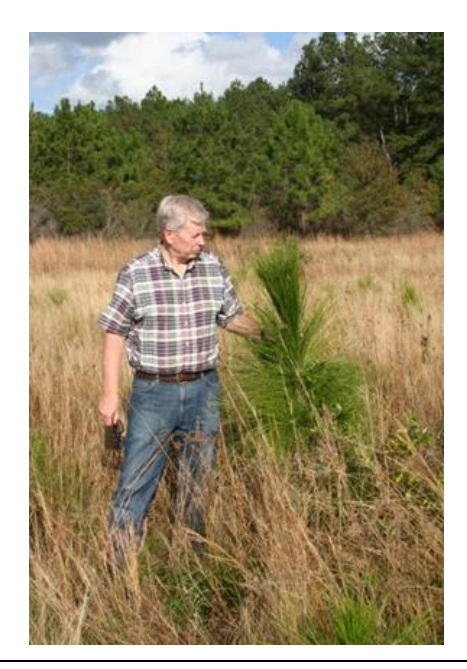
Figure 5. Research showed that Pinus palustris seedlings grown in containers generally have better survival than their bareroot cohorts and more promptly grow out of the grass stage.

guidelines for quality attributes developed from field trials, leading to container seedlings now being the target plant when P. palustris is outplanted (see Jackson et al. 2012).