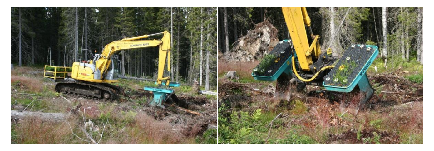
Figure 3. Self-propelled planting machines in Scandinavia can efficiently plant container seedlings on forest sites. The seedlings and machine were designed in concert, and in response to a dwindling, more expensive labor force.