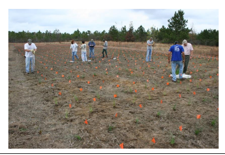
Figure 4. Installing a well-designed stocktype experiment requires minimizing confounding variables during nursery production as well as avoiding them on the outplanting site. When done properly, these studies can provide valuable information for defining target plant materials.

On the outplanting site, key considerations to avoid confounding variables include: (1) plant all stocktypes concurrently and during the appropriate outplanting window; (2) avoid having a single planter responsible for planting a single stocktype or a single treatment (either one planter installs the whole trial or several planters equally share the planting of each stocktype and treatment); (3) use a solid statistical design for appropriate analysis and interpretation (Fig. 4; Owston and Stein 1974; Pinto et al. 2011; Haase 2014).