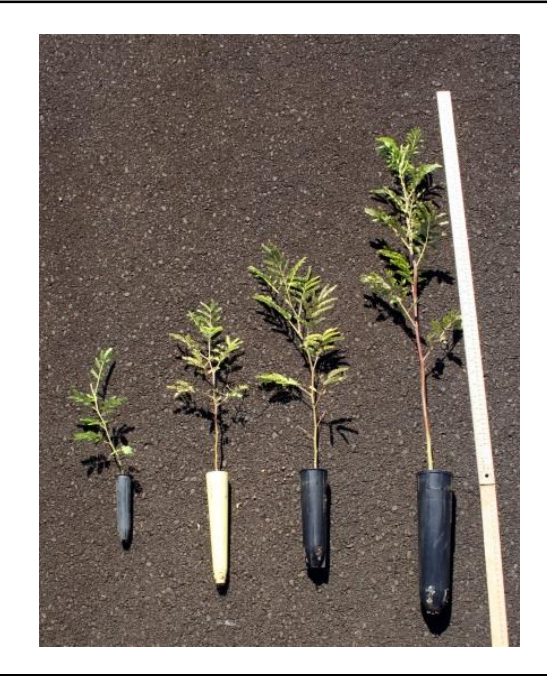
Figure 6. These Acacia koa seedlings are all the same age. The seedling on the left is the current stocktype widely outplanted, and performs well on sites where competition is controlled and herbivores are excluded. The seedling on the far right has been shown to thrive better than the small stocktype on highly competitive sites. Because the larger seedling grows faster, it may be desired when an objective is reducing time to canopy closure.