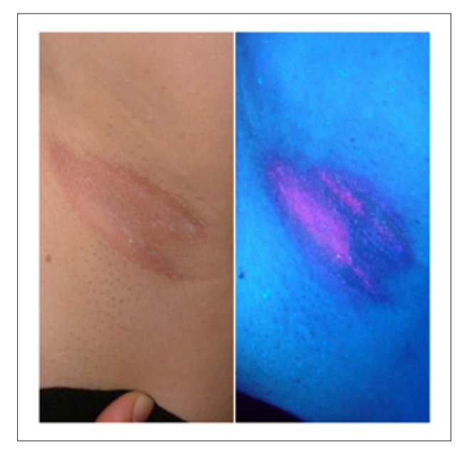
Fig 2. The coral red of Corynebacterium minutissimum in erythrasma under Wood's lamp examination.

*Medical competency assessment criteria for Thai national license in 2012 defined as physician must know this subjects.