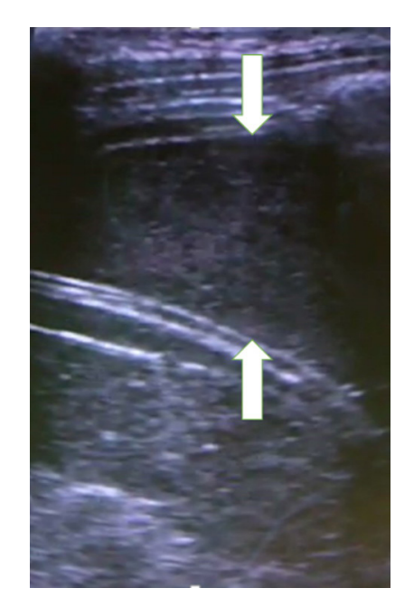
Fig 2. EFAST demonstrates intrathoracic fluid or hemothorax (between white arrows).

A. Black arrow: normal "lung sliding", white arrows: "comet tail artifact" B. Bracket: presence of pneumothorax (loss of "lung sliding")