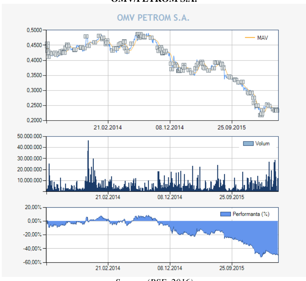
Fig. 5 The evolution of company shares, announcements and performance for OMV/PETROM S.A.