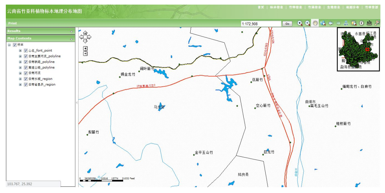
Fig.3 Hawkeye effect diagram

of the geographical distribution of production and plant specimens yunnan bambusoideae map maker. Based yunnan bambusoideae statistics in Arc Map on species where bambusoideae prefecture graded display.