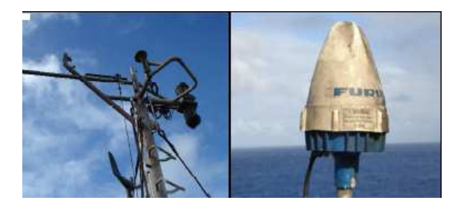
Figure 1: Electronic equipments damaged by exhaust gases.

The downwash of exhaust causes funnel gases to dissipate downward toward the deck more rapidly than upward. This has many adverse consequences like the sucking of hot exhaust into the main engine intake and the ships ventilation system in additional to high temperature contamination of topside electronic equipment (Please see Figure 1) and interference of the smoke with helicopter operations.