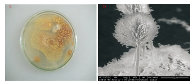
Figure 1.a:Pure culture of Isolate1; b: SEM micrograph of Isolate 1.

The ITS region is now perhaps the most widely sequenced DNA region in fungi, It is most useful for molecular systematics at the species level, and even within species. In the present study, the DNA was isolated from the Isolate 1 and the ITS region of 5.8s rRNA was amplified using specific primers ITS1 and ITS4 and the sequence was determined using automated sequencers. Blast search sequence similarity was found against the existing non redundant nucleotide sequence database thus, identifying the fungi as Aspergillus ochraceus. The percentage of similarity between the fungi and database suggests it as novel strain. Thus, the novel strain was named as A. ochraceus strain MP2 and made publically available in GenBank with an assigned accession number.