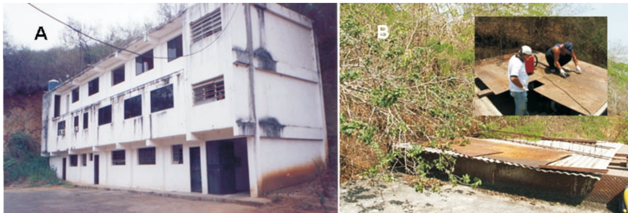
Figure 1. The homes colonized by T. maculata .

Five people occupied the building, which included the watchman living on the first floor and the family in study, composed of four members (3 years old boy, 6 years old girl, 36 years old mother and 42 years old father), on the second floor. The third floor was uninhabited without windows or