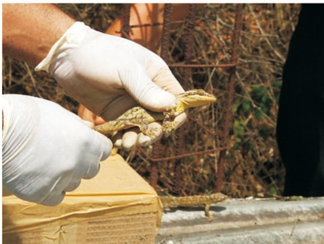
Figure 2. A gecko T. rapicauda captured in a T. maculata nest, in an apartment complex in Pitahaya, Miranda state. To the bottom right of the photo, another gecko can be seen escaping.

Thirteen nymphs were manually captured by the inhabitants in the apartment complex and brought to the Tropical Medicine Institute where the entomological inspection was carried out. Ten triatomines were located in the space between the two mattresses occupied by the children, and the mother captured three at the moment that the triatomines were ingurgitating on one of the children.