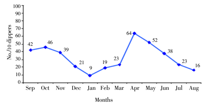
Figure 1. Monthly activity of anopheline larvae in Bashagard county, southeast of Iran during 2009–2010.

varied densities of the anopheline larvae vary markedly with the minimum in January and maximum in April (Figure 1).