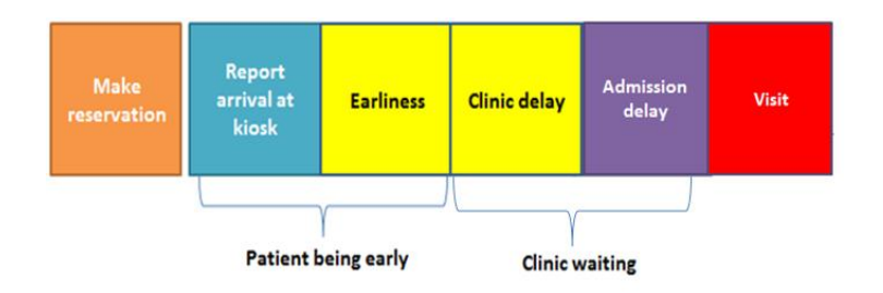
Figure 2: General delays in patient admission

majority of clinics and health care centers has been illustrated in Fig 2.