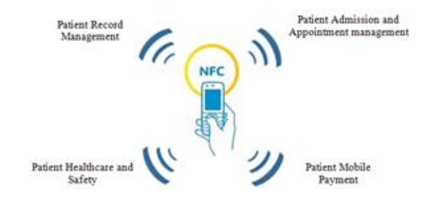
Figure 1: Typical RFID system parts (Left) & benefits and advantages of using NFC technology (right)