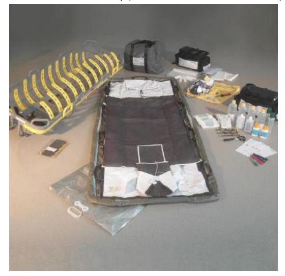
Figure 2. Transportation system provided with patient decontamination facility (www.karcher-futuretech.com)