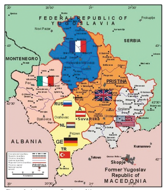
Figure 3. Autonomous Province of Kosovo

tion of Bosnia, or to adopt the strict measures for the conflict resolution, otherwise, no action from NATO's side would be negatively affected on the authority of NATO.