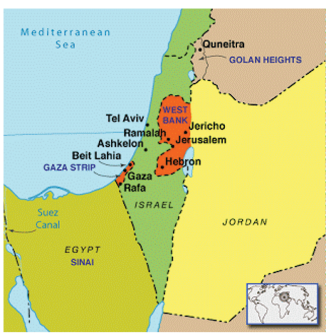
Figure 1. The State of Israel and the Palestinian Autonomy

Taking into account to establish close relations with the Arabic and in general with Islamic World and somehow compensate the threats and challenges, which are coming from the Middle East, democratic west is more and more interested in the peaceful resolution of the Israeli-Palestinian conflict by the establishment of the independent Palestine instead of recognition of Israel State by the Palestine and Arabic countries. The result was the adoption of the Road Map in the beginning of the XXI century, which envisages a comprehensive settlement of the Middle east conflict, including the Syrian-Israeli and Lebanese-Israeli tracks – based on Security Council Resolutions 242 (1967), 338 (1973) and 1397 (2002), the Madrid Peace Conference, the principles of land for peace etc.