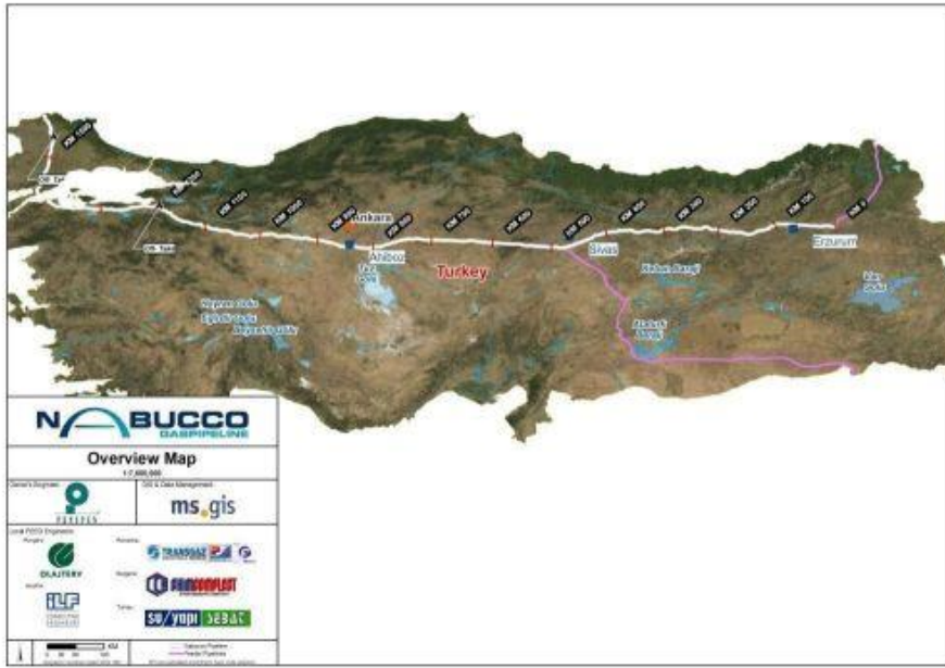
Figure 4 TANAP