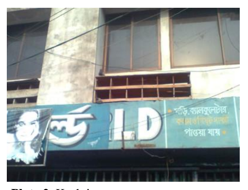
Plate 2. Kushtia town