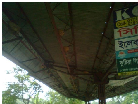
Plate 3. Poradaha Railway Station