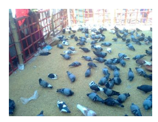
Plate 1. Sylhet Shah Jalal Majar