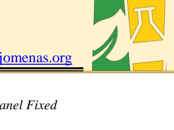
Table 6: The effect of Economic Freedom Indices on Output per Worker through Productivity using Panel FixedEffects Regression.