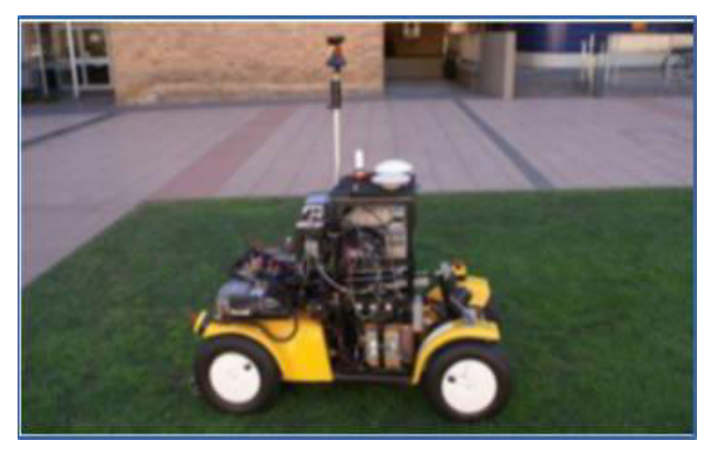
Figure 3: Integrated GPS+INS+Locata test car on UNSW campus.

Another important application of Locata (on its own or in combination with GPS) is deformation monitoring of structures such as buildings, bridges or dams. Early Locata testing was conducted in Sydney and in Nottingham (U.K.) and demonstrated the benefit of augmenting GPS with Locata signals in order to improve availability, and consequently improve the horizontal accuracy. Recently Locata-only tests were conducted on a dam structure, the Tumut Pond Dam. Comparison with 3D coordinates derived from a robotic total station confirmed sub-cm level repeatability, as well as sub-cm accuracy (under the assumption there was no dam wall movement).