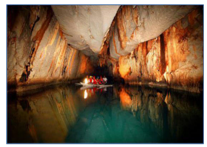
The place in the image is good to visit, but difficult to navigate and connect with people over phone. Since locata till now has already reached indoors, mountaintop, harbour system, etc. It's the time to implement it in an

For example, consider a place which is at underground sea level as shown below: