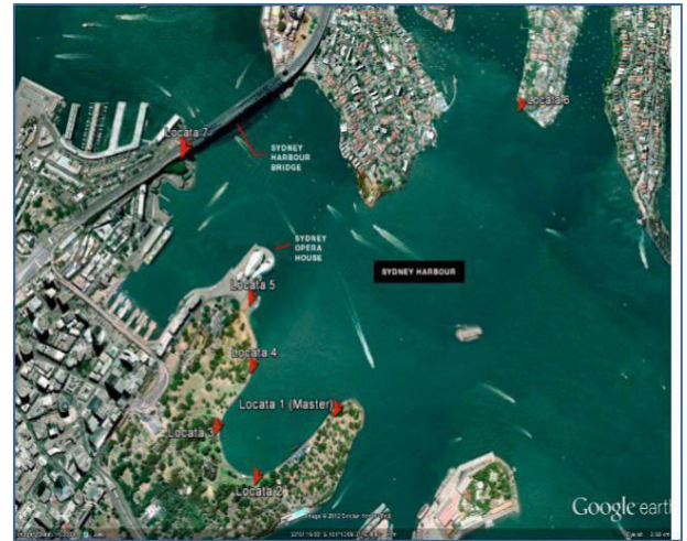
Figure 8: LocataNet established for 10 October 2012 Sydney Harbour tests.

In October 2012, a Locata test-bed for positioning in the Sydney Harbour area was set-up with the assistance of NSW Land and Property Information (LPI) and Sydney Ports. A LocataNet was deployed to service the area of Farm Cove (Figures 6 & 7), and the Locata receiver was deployed on a Sydney Ports vessel (Figure 8). Preliminary results were shown by Paul Harcombe (Chief Surveyor and Director of Location Policy, LPI) at the spatial@gov Conference in Canberra in November 2012, in a presentation titled "Sydney satellites – towards ubiquitous positioning infrastructure". A comparison with GPS-only positioning showed that the Locata-only solutions were different by about 4.4 cm. This was the first demonstration of Locata in an urban-like environment.