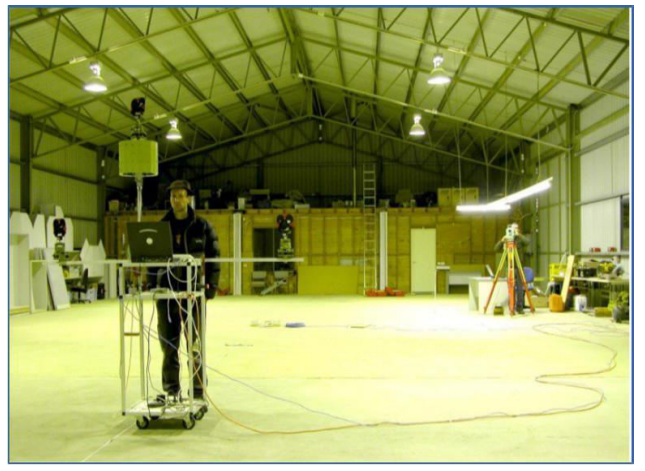
Figure 5: Indoor test site, Locata receiver on trolley and RTS set-up.

Static (Locata receiver placed over nine known points marked on the ground) and kinematic tests were conducted. Apart from some initial convergence challenges, all static coordinates were determined to cm-level accuracy. The kinematic tests indicated that the trajectory was in almost all cases less than 3 cm from that derived using the RTS. (Note that the pole was not perfectly vertical, and that there was movement of the prism relative to the TimeTenna.)