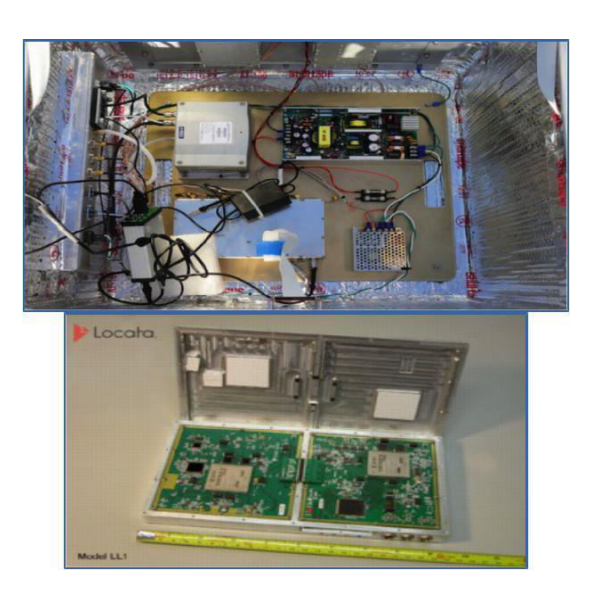
Figure 1: (a) LocataLite inside box with cabling to antennas, and (b) Locata receiver box.