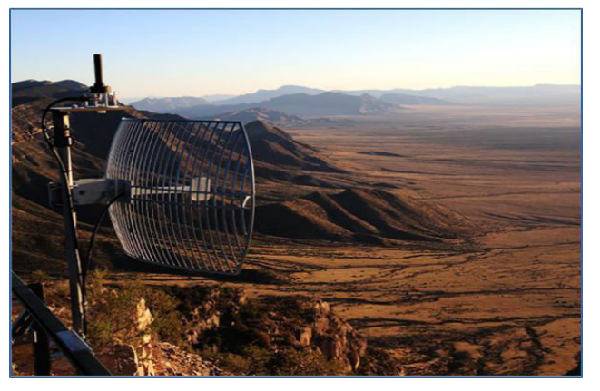
Figure 2: One LocataLite installed on a mountaintop at White Sands Missile Range.

The Locata technology's potential was confirmed in a September 2010 announcement that Locata Corporation had been awarded a contract by the USAF 746th Test Squadron (746TS) to deliver a system able to provide an independent high- accuracy positioning (sub-decimeterlevel) capability over almost 6,500 square kilometers of the White Sands Missile Range whenever GPS is undergoing jamming tests (see Figure 2 for one of the LocataLite installations). Locata was used on several types of aircraft. Craig and Locata Corp. (2012) reported on the extensive tests results. The USAF awarded Locata Corporation the contract for the delivery of technology for the High Accuracy Reference System through to the year 2025. The 746TS described Locata as "the new 'gold standard truth system' for the increasingly demanding test and evaluation of future navigation and navigation warfare systems for the U.S. Department of Defense".