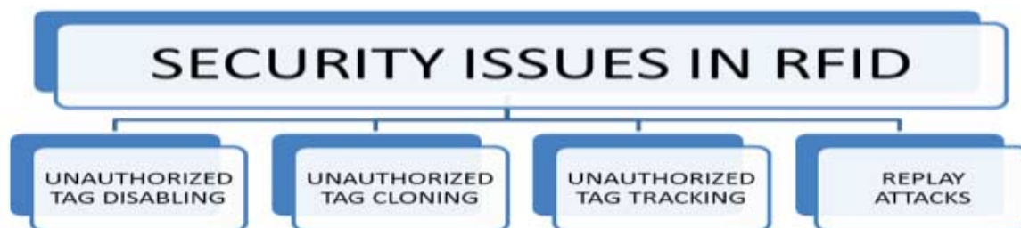
Figure 3 – Security Issues in RFID