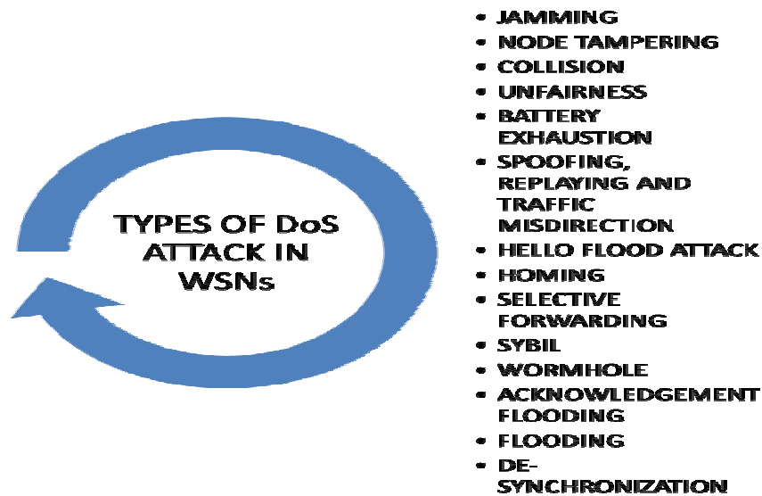
Figure 2 - Types of Denial of Attack in Wireless Sensor Network