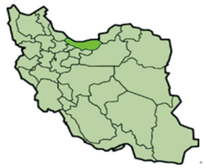
Figure 1. The scope of the study area in north of Iran.

The studied areas are located in Sari, Mazandaran Province, Iran. (Figure 1). A total of 580 soil samples were collected from 21 areas. Sampling of the soil was undertaken to differentiate infected areas and to determine the prevalence of parasites in the soil.