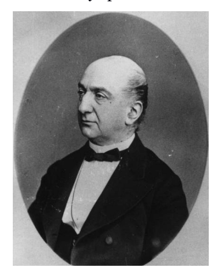
Fig. I. D. Delyanov, the Minister of Public Education

The Ministry of Education could not achieve all the educational goals due to the vastness of plans, therefore there was a need to "attract" other interested authorities, the public, etc. "Certainly, the Orthodox Church, being the main educational institution in the Russian Empire could not stay apart from all these changes" (Boguslavskii, 2008).