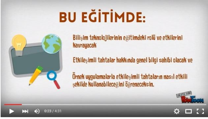
Figure 4. Information Screen

In the last stage, the aim was to produce a material with an appearance that is pleasing to the eye and reflect visual integrity. For this, a color wheel was examined and a color set was formed from the complementary colors on the disk [20]. All of the screens were designed by staying consistent to the colors on the color set. Moreover, while producing the material, we aimed to stimulate the emotions of the teacher candidates. In order to accomplish this, contents that emphasized the importance of the subject and the teacher candidate were designed and accompanied with background music that was expected to motivate the audience (Figure 5).