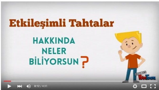
Figure 3. A Sample Screen Shot

The development phase also benefitted from the instructional events outlined by Gagné. The gaining attention event is described as ensuring the learners concentrate on the content of the material by applying special methods to draw their attention to the subject point. In the developed material, in order to gain the teacher candidates' attention, a page asking a question was designed as shown in Figure 3.