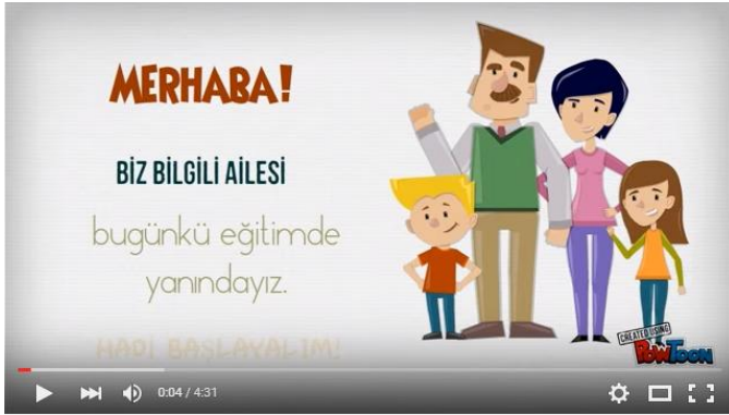
Figure 2. The Introductory Screen

The second principle of Mayer that was used in the production of the material was the signaling principle. According to this principle, when the key words and pictures that are crucial for the instructional subject are emphasized, the learning process becomes more permanent [12]. For this reason, in the content of the material, some cues have been used, some words have been emphasized, and appearing-disappearing effects and different colors were used to grab the attention of the user. In Figure 2, the introductory screen is shown.