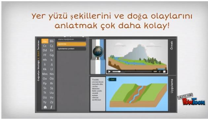
Figure 1. A Screenshot from the Geography Lesson

During this phase, the content of the instructional material was designed. The content to be transferred into the material was first written and saved in a word processor file, then the texts and instructions used in the material were extracted from this file. In particular, the contents suggested on the web site of EBA (Educational Informatics Network) – a sub-project of FATİH project which comprises reliable online resources- were used for creating this file [16]. For this, a sample of instructional software programs created for various courses and suggested on the EBA website, were examined and subsequently referred to in the developed material (Figure 1).