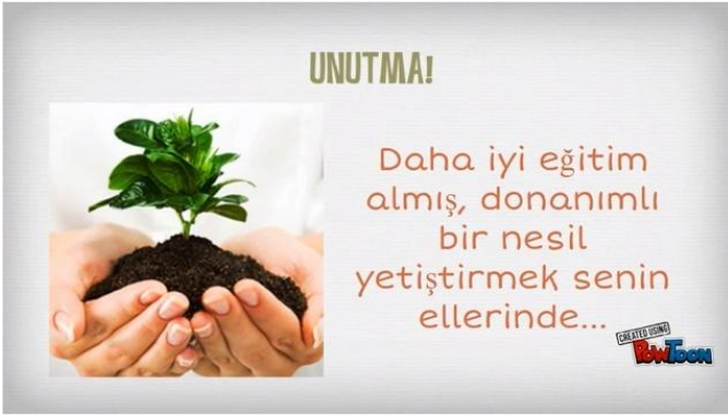
Figure 5. A Sample Screen for Motivation

In the last stage, the aim was to produce a material with an appearance that is pleasing to the eye and reflect visual integrity. For this, a color wheel was examined and a color set was formed from the complementary colors on the disk [20]. All of the screens were designed by staying consistent to the colors on the color set. Moreover, while producing the material, we aimed to stimulate the emotions of the teacher candidates. In order to accomplish this, contents that emphasized the importance of the subject and the teacher candidate were designed and accompanied with background music that was expected to motivate the audience (Figure 5).