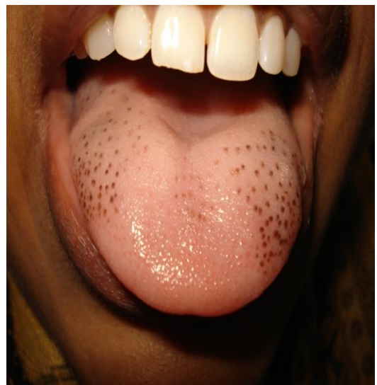
Fig. 1: Black pigmented lesions on the dorsum and lateral border of tongue: Pigmented Fungiform Papilla of the tongue (PFPT)

The patient was reassured of the benign nature of the condition and tablet iron and folic acid once a day was given for 6-months.