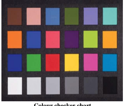
Colour checker chart

An accurate colour chart is needed when photographing the bite mark to ensure correct colour calibration when using a computer. For consistent results a colour chart should be visible in every image that is taken because slight changes in the distance between the flash and subject will have an influence on brightness within the image and will create slight variance in the colour.