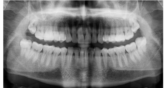
Fig. 2: Orthopantomogram showing maxillary and mandibular third molars to be impacted bilaterally