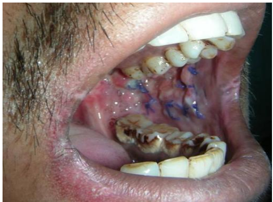
Fig. 7: Left side buccal mucosa healing after 1 month

The procedure was successful in achieving desired goal of adequate mouth opening. Healing was uneventful with no breakdown or liquefaction necrosis post operatively (Figure- 7, 8). Approxima-tely 30 mm of interincisal distance was achieved and maintained postoperatively with vigorous mouth opening exercises (Figure-9).