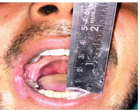
Fig. 9: Interincisal opening after 1 month