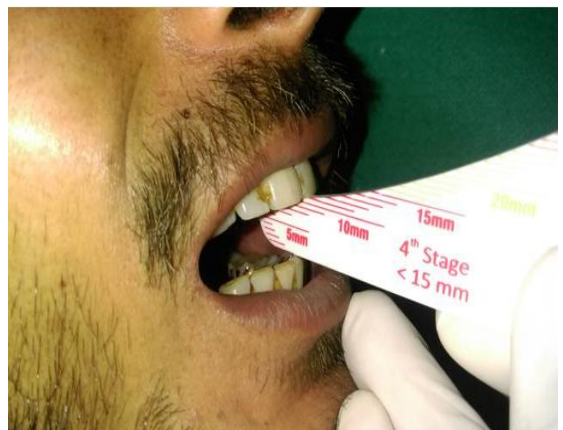
Fig. 1: Restricted mouth opening (10mm)

Patient was kept on intravenous antibiotics which include Amoxicillin plus clavulanic acid 1.2 gm twice daily and intravenous Metronidazole 500 mg thrice daily for three days postoperatively. Pain control was achieved using intramuscular injections of Diclofenac sodium twice daily for first 48 hours postoperatively; followed by oral route. The patient was advised liquid diet postoperatively for at least 1-2 week. Vigorous mouth opening exercises were started from 5<sup>th</sup> day postoperatively using Heister mouth gag.