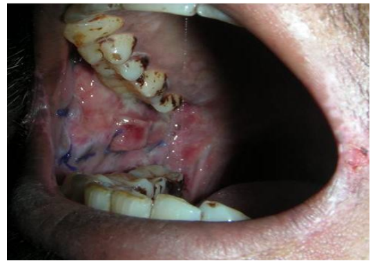
Fig. 8: Right side buccal mucosa healing after 1 month