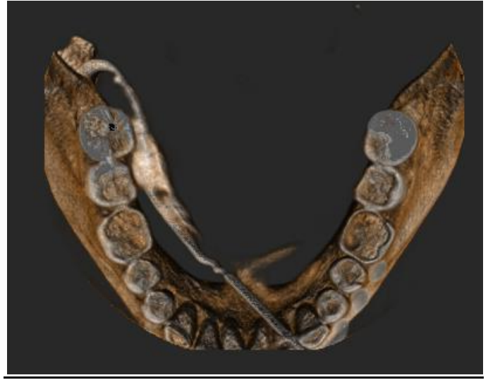
Fig. 2: 3D image of the CBCT guided sialography of right submandibular gland. The needle of the cannula and the Wharton's duct are clearly visualized in the floor of the mouth. The sialolith can be appreciated in the posteromedial aspect of the mandible