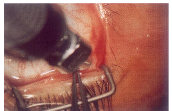
Fig. 2: Sub-Tenon's Cannula Introduced into the Tenon's Space