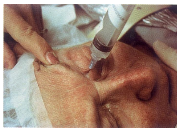
Fig. 1: Peribulbar Anaesthesia

Complications: With peribulbar technique, two patients (0.8%, 2 in 250 cases) had inadvertent globe perforation and one patient (0.4%, 1 in 250 cases) developed retrobulbar haemorrhage. 24 guage needle (Sharp) was used to administer peribulbar block.