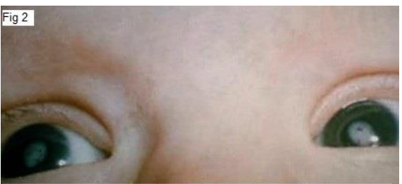
Bilateral centrall dense congenital rubella cataract in 6 month old child.

Indian Journal of Clinical and Experimental Ophthalmology, July-September, 2016; 2(3): 195-200