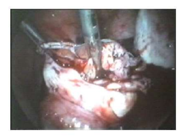
Completion of stripping upto hilus