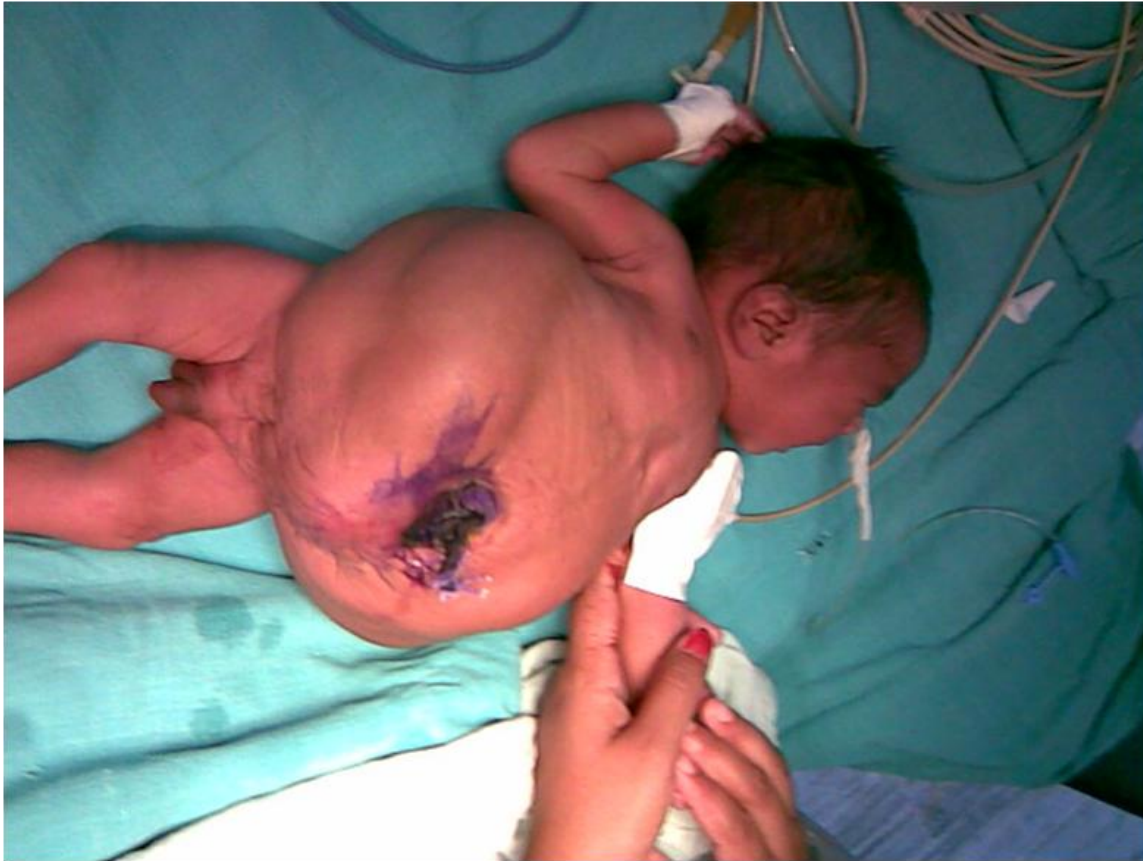
Figure 1. PBS