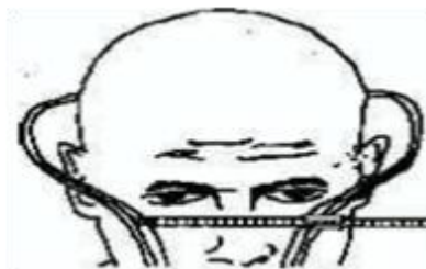
Figure 2. Showing Maximum Head Breadth