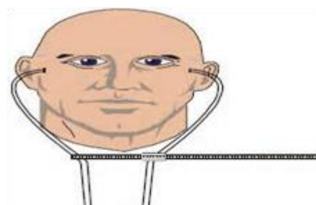
Figure 4. Showing Facial Width