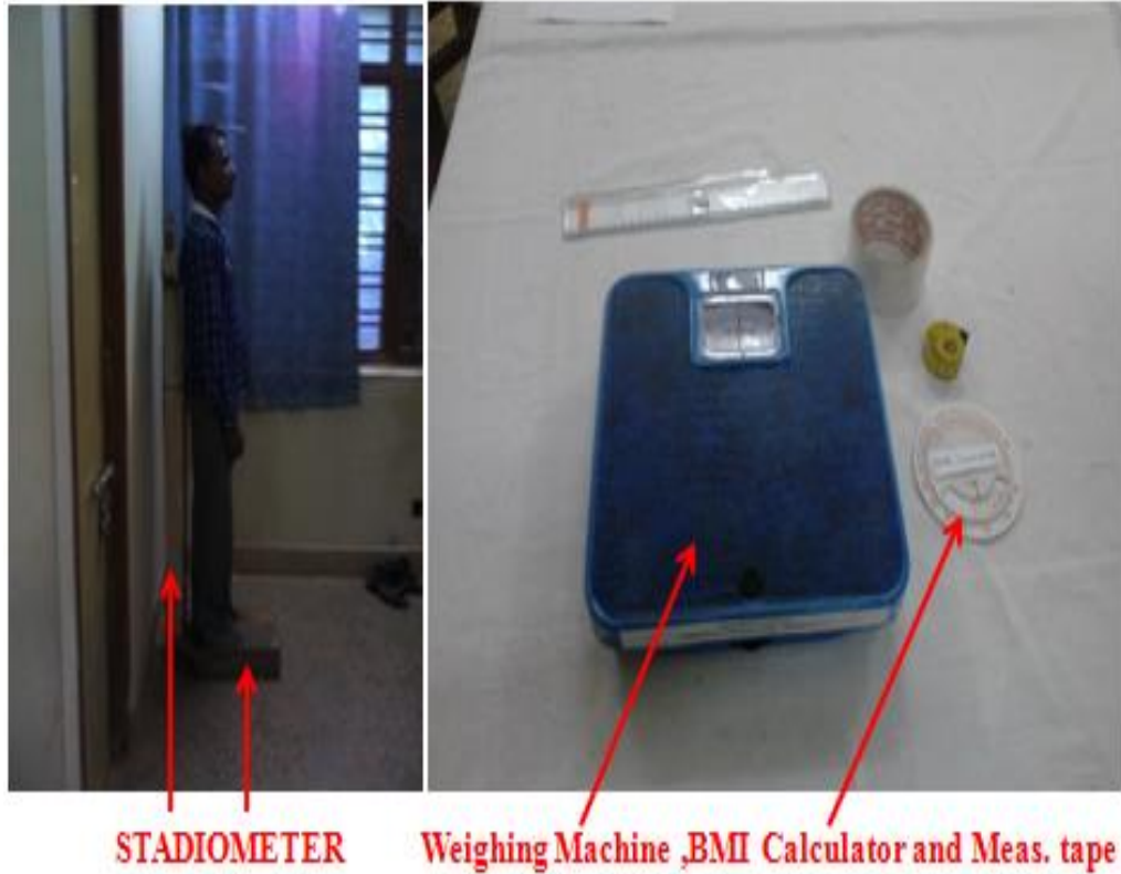
Fig. 1: Materials used for BMI study