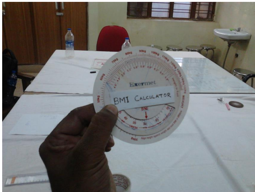
Fig. 2: BMI calculator