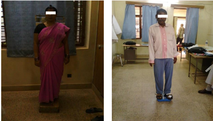
Fig. 3: Measurement of Height and weight for BMI calculation