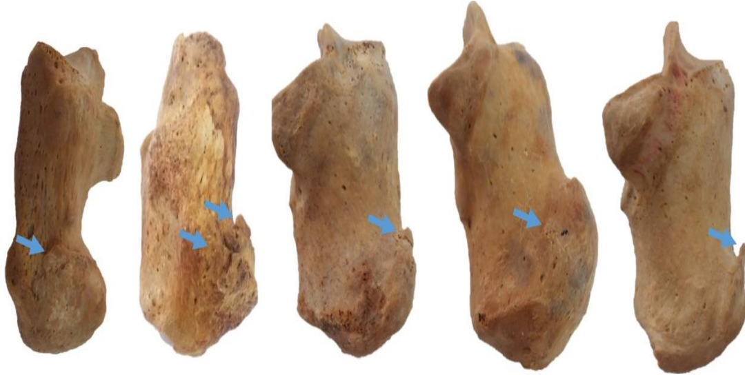
Figure 1: Enthesophytes documented in the study. (blue arrows)