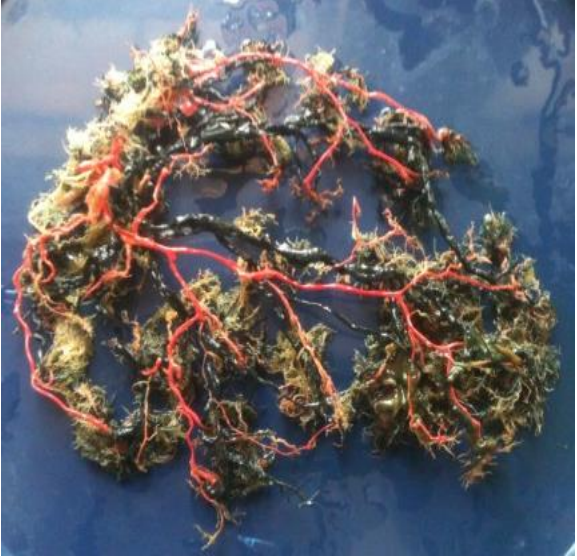
Fig. 4: Cast of oval placenta with magesterial pattern