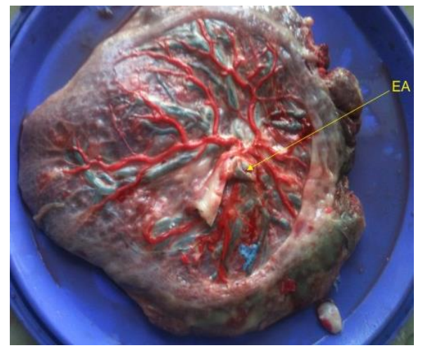
Fig. 3: Oval shape placenta