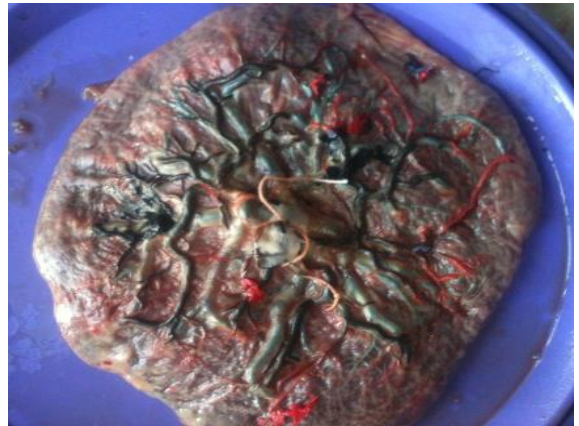
Fig. 1: Round shape placenta

Irregular category include all the placenta which do not fall in round to oval category eg. triangular, ill defined shaped. In 2% of cases single umbilical artery with irregular shaped placenta was found (Fig. 5). The foetus was stillborn in both cases.