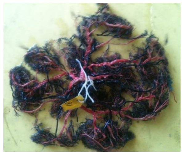
Fig. 2: Cast of Round shape placenta with dispersed pattern