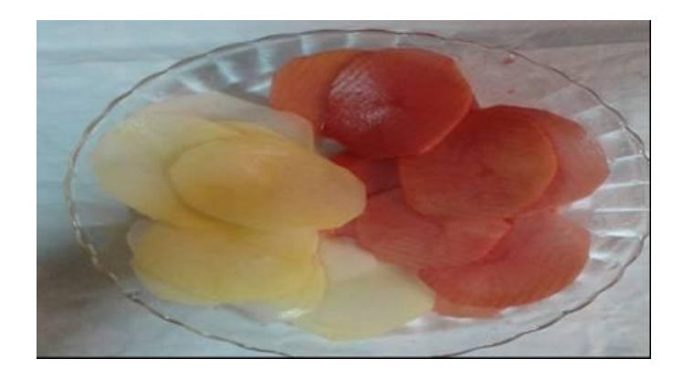
Figure 3: Potato chips after treatment with aqueous extract of roselle and control.