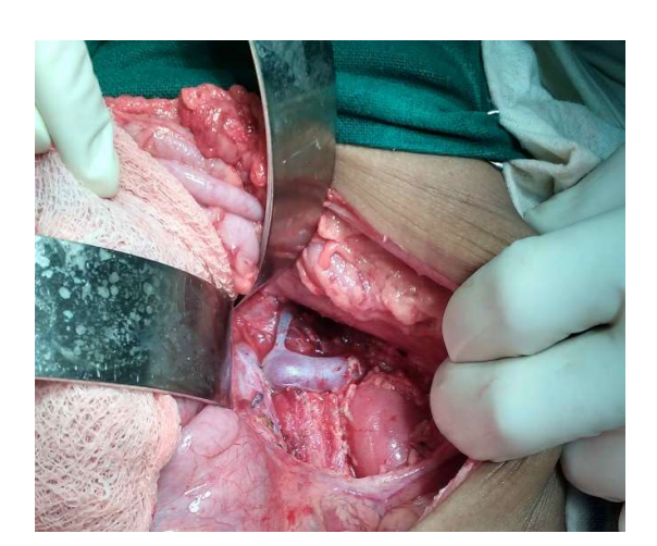
Fig. 2. End to side anastomosis between LRV and IVC.

abdominal incision. Left side colon and small bowel was retracted to right side of midline and posterior peritoneum and Gerota's fascia over the left kidney opened. LRV was found to be dilated. LRV was traced up to its insertion into IVC .Left suprarenal vein, left gonadal vein and left lumbar vein draining into LRV identified and preserved. IVC delineated from the point of insertion of left renal vein to 4 cm distally. LRV and left renal artery looped up. IVC controlled with a side biting clamp. LRV clamped, divided and stump transfixed at IVC with prolene 7-0 RB. Opening made in the IVC 4 cm from its junction with the renal vein and end to side anastomosis done with prolene 7-0 RB [Fig. 2].