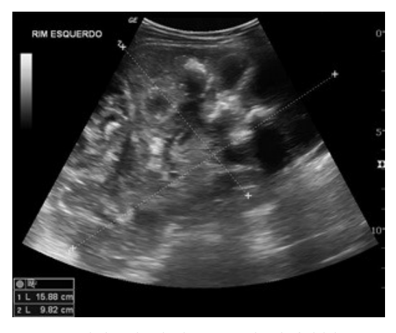
Fig. 1. Abdominal ultrasound – left kidney hydronephrosis, measuring 15,88 x 9,82cm.

In the first semester of 2014 he returned with fever and urinary symptoms, and workup showed calculi and hydronephrosis in left kidney again [Fig. 1,2], this time with renal lithiasis also on right kidney.