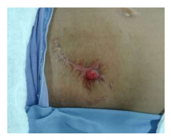
Fig. 4. Final abdominal aspect after uretherostomy surgery.

Due to the clinical conditions and great amount of pus inside the left kidney collector system, decision was taken to perform external drainage of the renal pelvis. Uretherostomy was performed and the patient had good clinical improvement [Fig. 4].