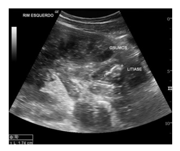
Fig. 2. Abdominal ultrasound – debris in collector system and hyperechogenic image with acoustic shadow - staghorn calculus measuring 1,74 cm.

Urine culture was positive (Proteus mirabilis > 100.000 UFC/mL), and patient was treated again with pigtail insertion and antibiotics. Two weeks after hospital discharge, he returned to the emergency service with urinary tract infection symptoms. New ultrasound was performed and suggested pyonephrosis. CT scan was performed [Fig. 3].