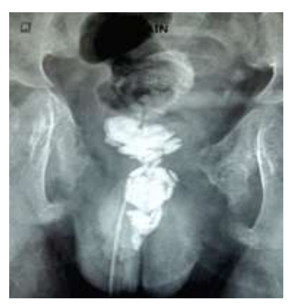
Fig. 2. Plain X-ray KUB showing calculi in the bladder and urethra

On SPC gram, the fistulous tract could be seen up to the perineum [Fig. 3].