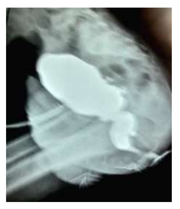
Fig. 3. SPC gram of the patient showing the fistulous tract.

On SPC gram, the fistulous tract could be seen up to the perineum [Fig. 3].