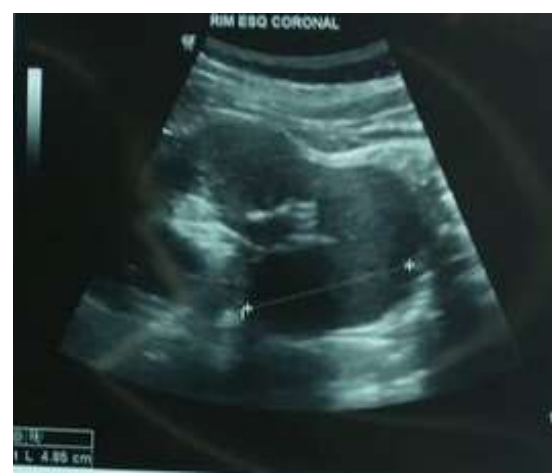
Fig. 2. Ultrasound – multiple cysts suggesting dysplastic multicystic kidney.

Ultrasonography demonstrated various cysts in left kidney with irregular content, suggesting dysplastic multicystic kidney, the largest cyst was in the inferior pole with a diameter of 3,6cm [Fig 2].