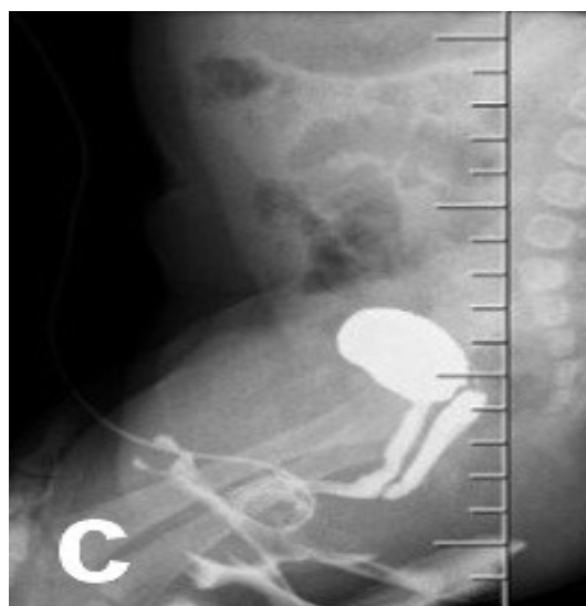
Fig. 2. (A, B, C) Urethrocytogram and genitography.

The initial chosen approach was laparoscopy, which revealed a rudimentary uterus, bilateral gonads and spermatic elements entering the inguinal canal. Other Müllerian derivatives (ovaries) were absent.