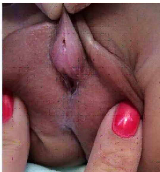
Fig. 1. Genitalia aspect at first admission.

The first physical examination at our institution showed micropenis measuring 2,5cm, penoscrotal hypospadias, right gonad palpable at bifid scrotum and left gonad palpable in the inguinal canal [Fig. 1].