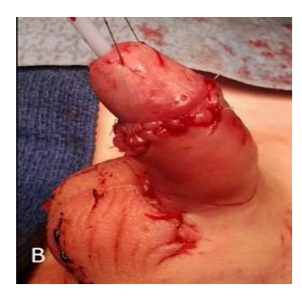
Fig. 3. (A) Skin flaps were used to close the superficial defect covering a raised Dartos flap overlying the repaired pendulous urethra. (B) Re-approximation of the skin at the level of the circumcision.

The patient had an uneventful hospital course, and was observed in the hospital overnight Vancomycin on and Piperacillin/Tazobactam. Rabies prophylaxis was not administer since it was a known new born, house dog that was previously vaccinated and there were no concerns for Rabies infection He was discharged home on Amoxicillin/Clavulanate. The Foley catheter and dressing were removed one week post-operatively. With the exception of minor sloughing at the ventral mid-shaft skin, the wound noted to be healing well. At the one month follow-up visit, the parents reported a good stream and no postoperative chordee and at seven-months, his