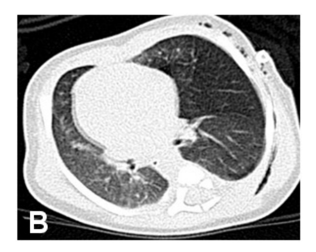
Fig. 3. CT scan confirming the diagnosis of CLE.

As the child kept the severe respiratory distress, all the efforts were to treat the CLE till he was clinically stable. So in the 9<sup>th</sup> day of life the child was submitted to a left thoracotomy that confirmed the emphysema in the upper lobe, and an upper lobectomy was successfully done. The child had no problems in the post-operative period. The