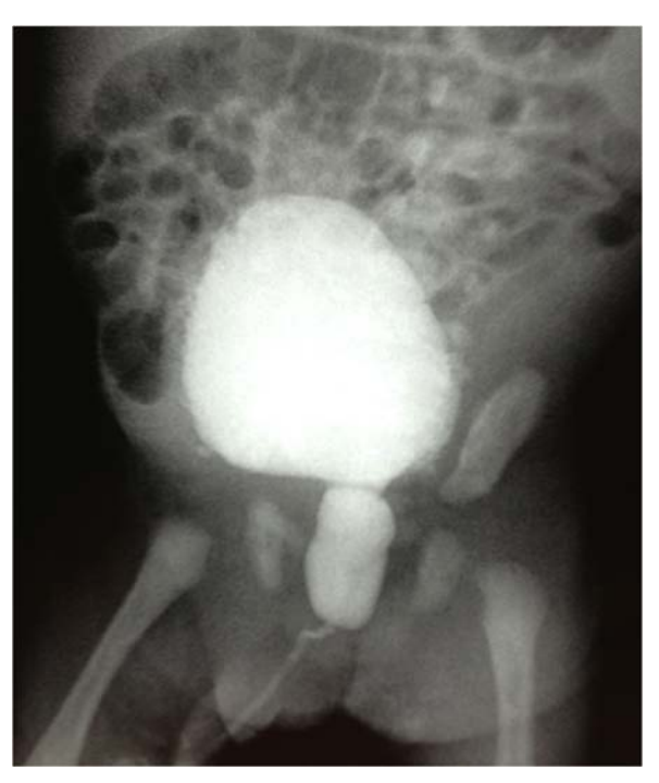
Fig. 1. Voiding cystourethrography confirming PUV.

distention of the left lung, which caused contra lateral mediastinal shift [Fig 2].