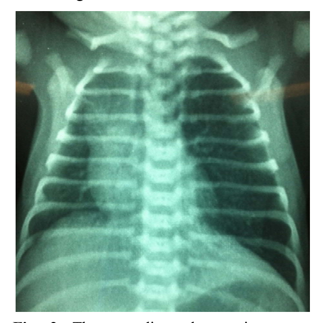
Fig. 2. Thorax radiography sowing over distention of the left pulmonary parenchyma and contralateral mediastinal shift.