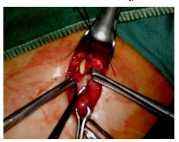
Fig. 3. Intraoperative finding with the distal end of VP-shunt inserted into the bladder dome.

Patient started with appropriate was intravenous antibiotics and underwent emergent procedure of extra peritoneal exploration with removal of VPS, and ventriculostomy tube insertion. Conduct of surgery began with simultaneously with the neurosurgery team. A 3 cm low transverse pfannenstiel incision was done and carried down to the extra vesical space. Intraoperative abdominal findings showed the VPS was seen within the peritoneum and has created a fibrous tract that transversed down toward the bladder. It was noted to penetrate the dome of the urinary bladder (Figure 3). The length of the VPS that entered the bladder was 8cm. The distal part of the VPS was encrusted with inspissated pus [Fig. 4] and was removed successfully with ease from the urinary bladder. The bladder was closed as two layers using a 4-0 polyglycolic suture in a continuous interlocking manner.