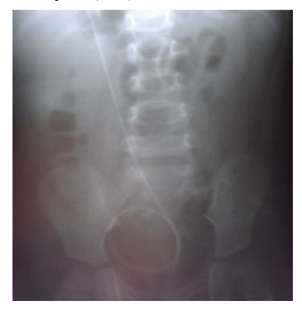
Fig. 1. X rays of the urinary tract showing VP shunt distal segment in the pelvic location.

confirming the presence of the tip of the VPS to be coiled inside the urinary bladder [Fig. 1, 2]. Urinalysis showed pyuria and bacteriuria. The urine culture taken on admission showed the presence of Klebsiella oxytica with a growth of 120,000 colony-forming unit (CFU).