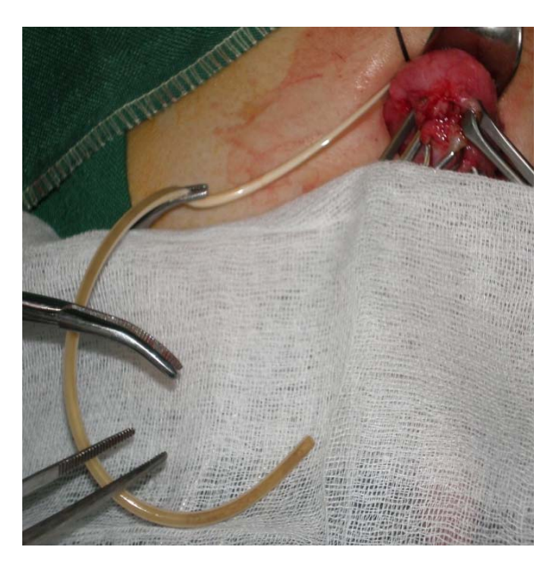
Fig. 4. VP shunt distal end extracted from bladder with mildly encrusted surface.

Α Burr hole craniotomy with ventriculostomy tube inserted into the left frontal horn and exteriorized for drainage. A separate cranial incision was done at the right parietal area of the skull and the infected VPS tube was removed. The infected VPS showed intra-luminal obstruction with caked and encrusted pus impeding flow of cerebrospinal fluid and proper drainage leading to recurrence of the hydrocephalus. Specimen from the drained abscess and the VPS was sent microbiology for culture and sensitivity. The VPS was then completely removed after the distal end was transected and removed from urinary bladder. Patient showed the immediate post-operative improvement in sensorium with spontaneous eye opening and purposeful movement of all extremities.