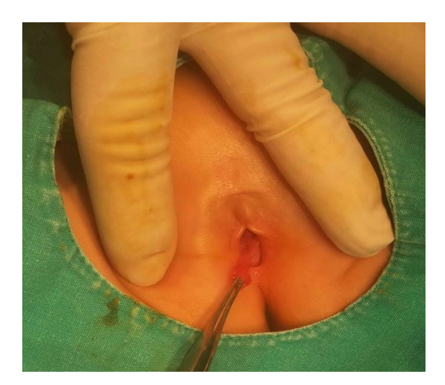
Fig. 1. A 1.2x0.5 cm polypoid mass, with a tall neck, originating from vaginal wall.

When the mass came out of the hymenal ring, physical examination revealed a 1.2x0.5 cm polypoid mass, with a tall neck, originating from superior vaginal wall [Fig. 1].