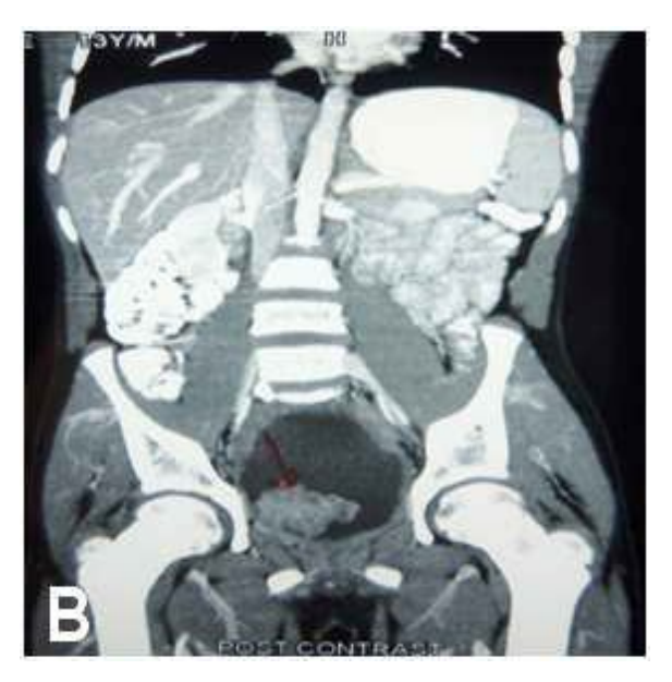
Fig. 2 A, B. CECT Scan showing the mass arising from the bladder