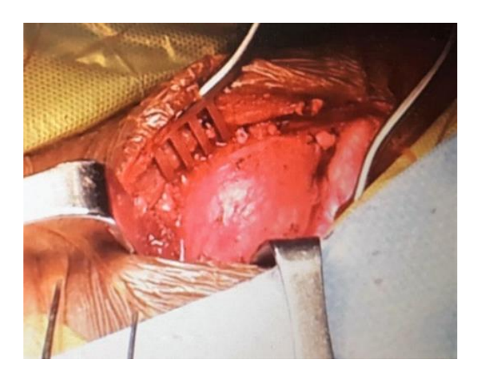
Figure 2: Intra operative photograph of the left paraganglioma lying nestled between the internal and external carotid arteries.

Figure 1: Coronal section of CT Neck with IV Contrast showing a hyper vascular mass at the left sided bifurcation of the internal and external carotid arteries. Lyre's sign can be observed here (blue arrow).