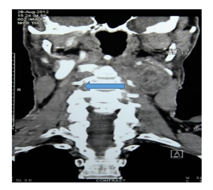
Figure 1: Coronal section of CT Neck with IV Contrast showing a hyper vascular mass at the left sided bifurcation of the internal and external carotid arteries. Lyre's sign can be observed here (blue arrow).

Histopathological report revealed that the mass was 5.0 cm x 3.0 cm x 2.5 cm with hemorrhagic cystic cavities but no atypical features such as increased mitoses or necrosis. The tumor was identified as a paraganglioma [Fig-4 &5] and there were no features of malignant transformation.