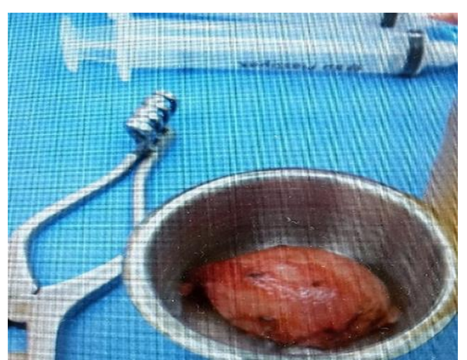
Figure 3: A photograph of the Carotid Body Tumor showing its Pseudo capsule